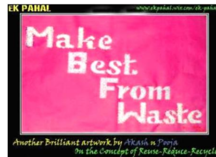
Perfect use of Thermocoal Powder with the message to Recycle things