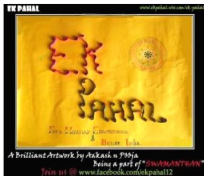
A Masterpiece from rolling papers