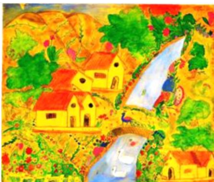
A fine blend of Colors with Imagination