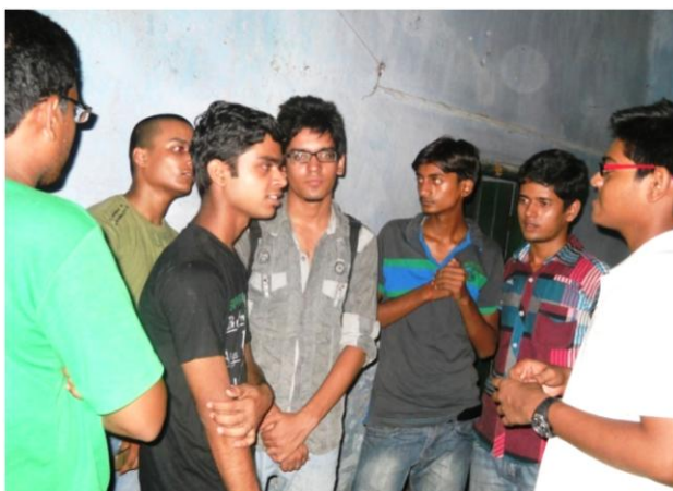
Students Interacting with Manoranjan in "Science in Daily Life" Session